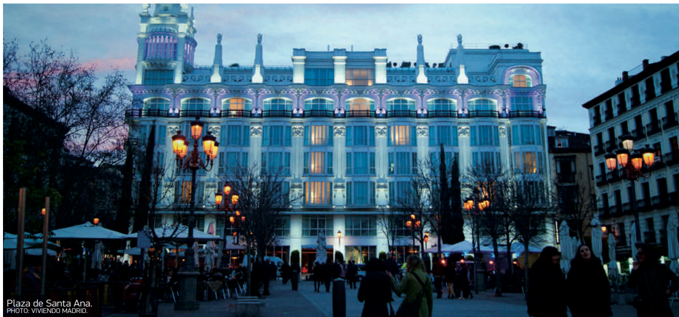
Plaza de Santa Ana.

»» Historical, literary and full of plaques in remembrance of its famous neighbours, the Las Letras district in Madrid is one of the most popular with tourists.