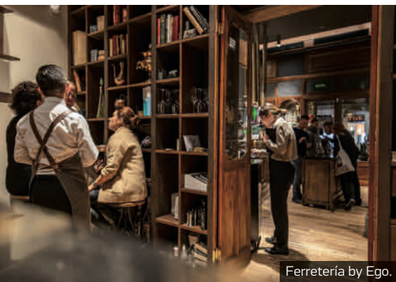
Ferretería by Ego.